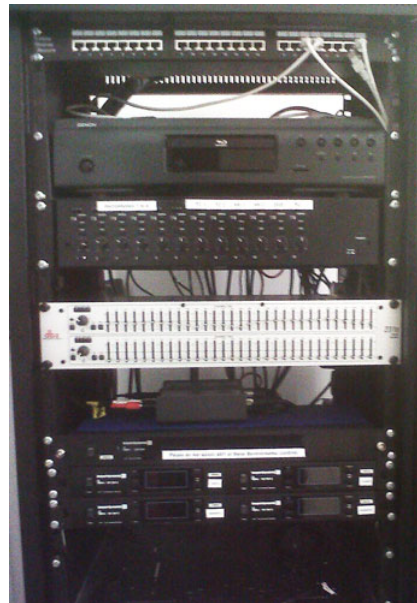
The system rack in the Main Hall.

To complement these features, we added a PDA200E induction loop system, with a live mic feed (for floor presenters) and a line input from the Onkyo AV receiver.